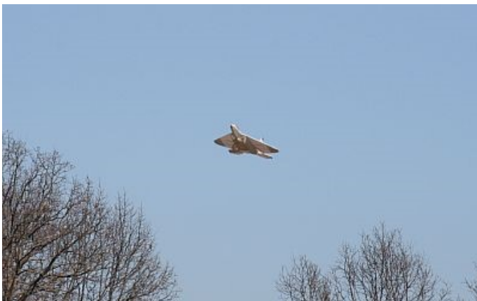
Above Fritz Corbin's F-22 foamy comes in over the leafless trees for a nice winter flight.

If you feel your 2015 Club dues are current but you are not on the above list contact Fritz Corbin for needed corrections.