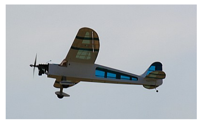
Another shot of Greg Moody's Aviator Pro 60 in the air. Seems to be a stable and graceful flier.