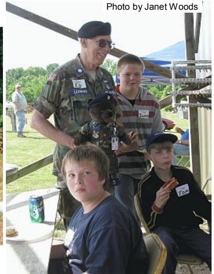
The CAP boss and some of his crew