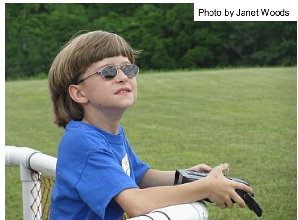
A future fighter pilot