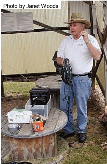
The event announcer