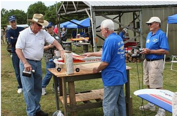
Getting the planes ready for the students