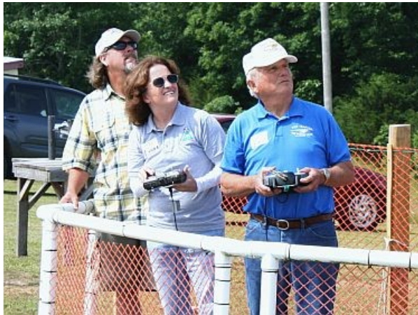
The instructor, student and pilot