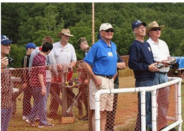
A couple more student pilots, on buddy-boxes, getting a taste of flying R/C aircraft