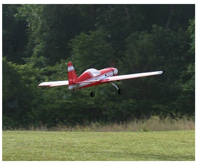
John Woods' Extra 300 coming in for a landing. This is the plane he was flying when the picture on the front page was taken.

PROGRAM: Fly before the meeting. It was too windy to fly after the meeting.