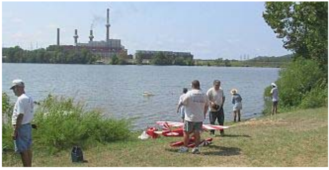
Above are a couple of photos of the Annual Black Sheep Float Fly which has been held on Springfield Lake for the last several years.

After one flight where I tipped my plane over on landing and after enjoying the free lunch we decided to call it a day since the wind was starting to pick up. Hope the Black Sheep are able to continue this annual fun Float Fly event even though it may be at a different location.