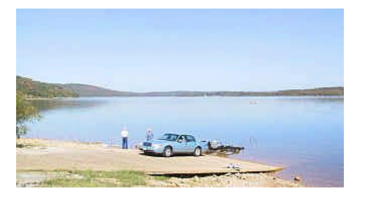
Henry Racette and Roscoe Fudge enjoying some float flying on Table Rock Lake