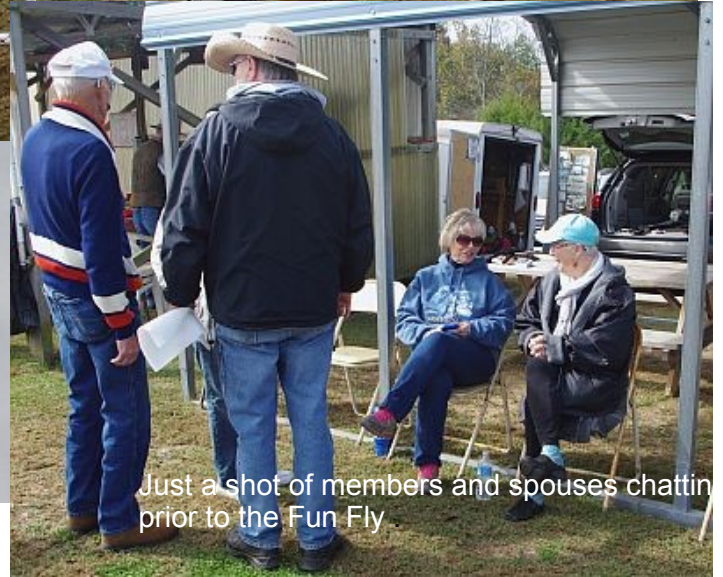
Just a shot of members and spouses chatting prior to the Fun Fly