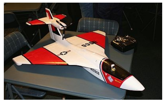
Jim Haney's new foam Polaris Ultra to replace several previous Polaris XL's.