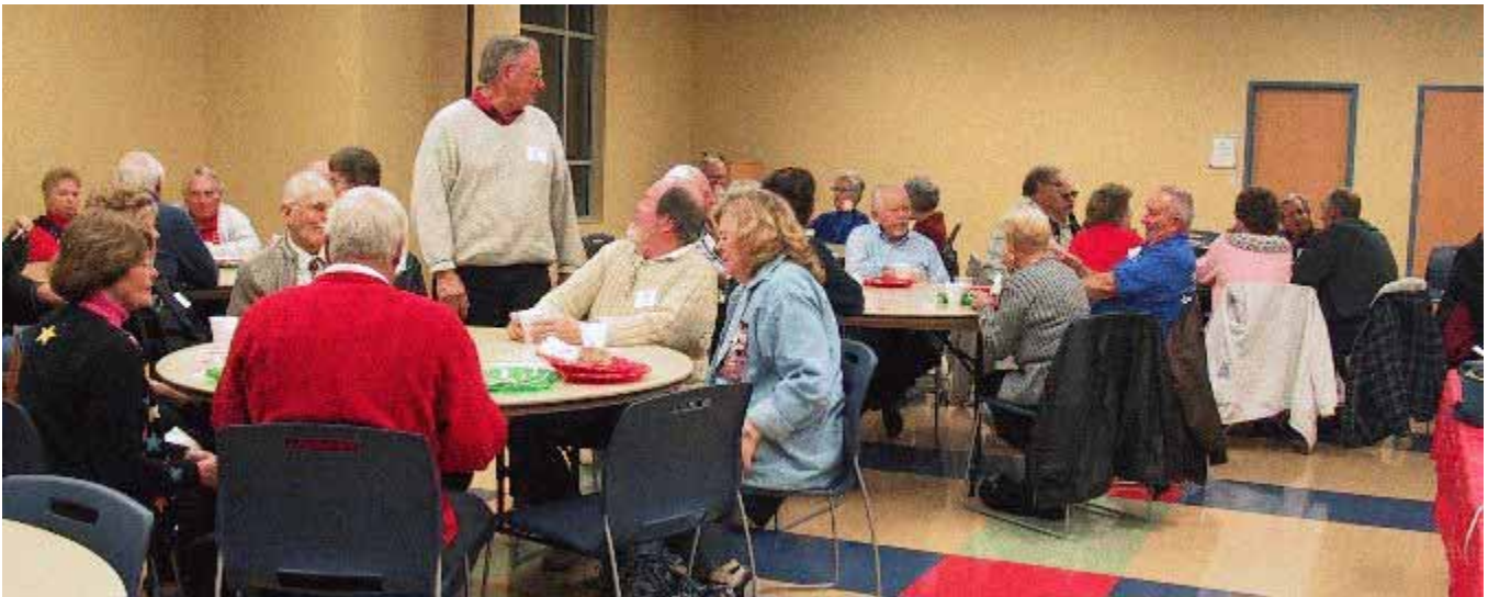
CHRISTMAS PARTY Here is a photo of many of the 38 members and guests that braved the bad weather to enjoy the Club's Annual Christmas party. A great time was had by all! Also collected several bags of stuffed toys to donate to the hospital.