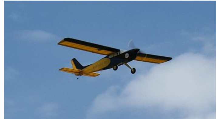
Don Johnson's new stick and tissue Pussycat. Don has built five Pussycats, two with 61.5 wingspans and then three of the 80% version with 50.4" wingspan. They have all flown very well.