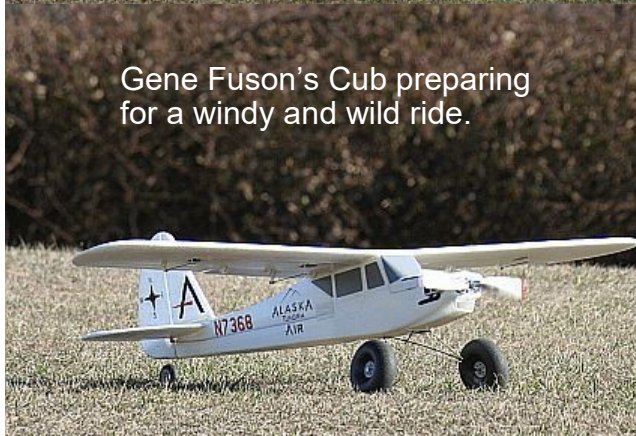
Gene Fuson's Cub preparing for a windy and wild ride.