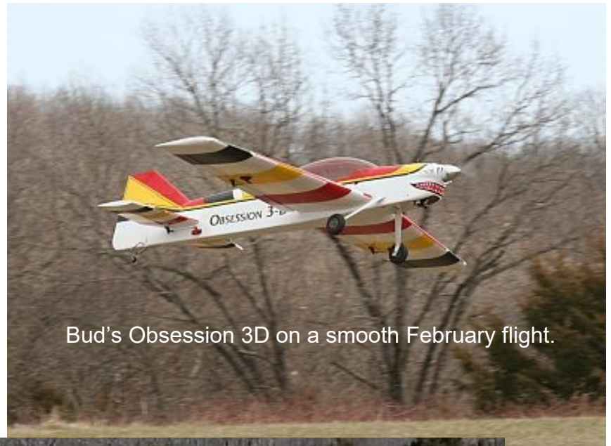
Bud's Obsession 3D on a smooth February flight.