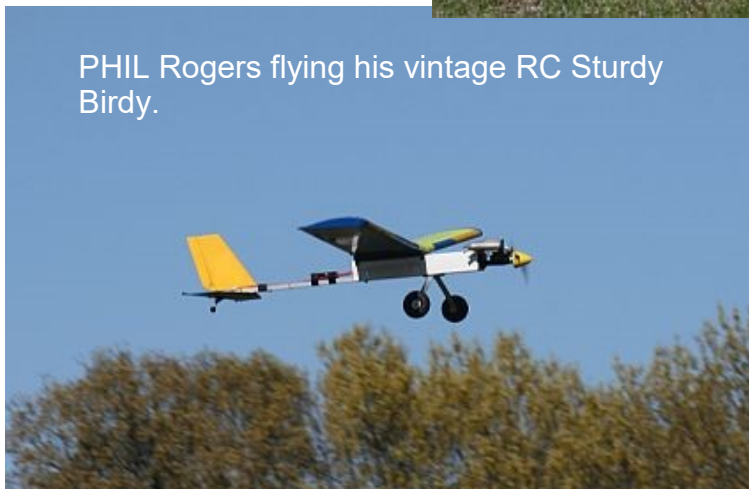
PHIL Rogers flying his vintage RC Sturdy Birdy.