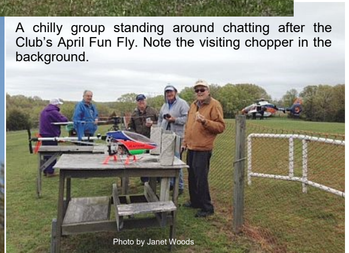
A chilly group standing around chatting after the Club's April Fun Fly. Note the visiting chopper in the background.