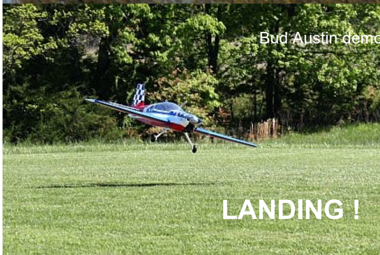
Bud Austin demonstrating how to land.