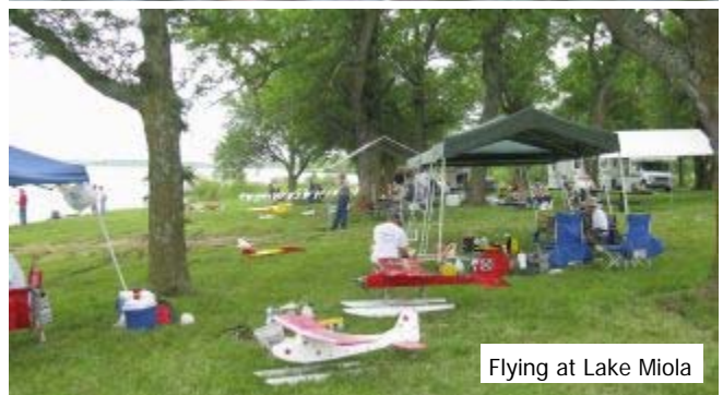
Flying at Lake Miola