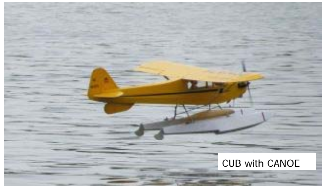
CUB with CANOE