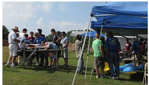
L.U.C. Boys Ranch group