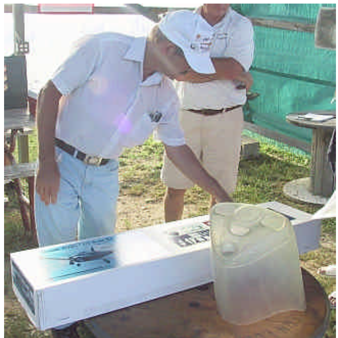
The McEvoy's new 10 foot Ercoupe.