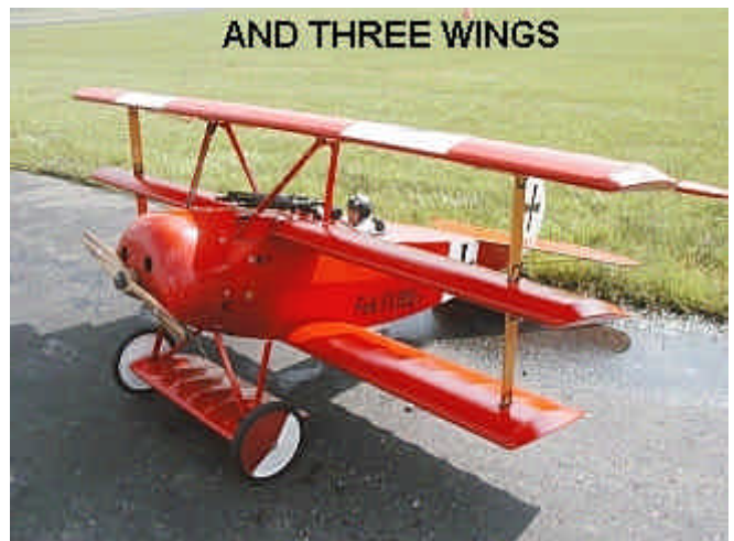
AND THREE WINGS