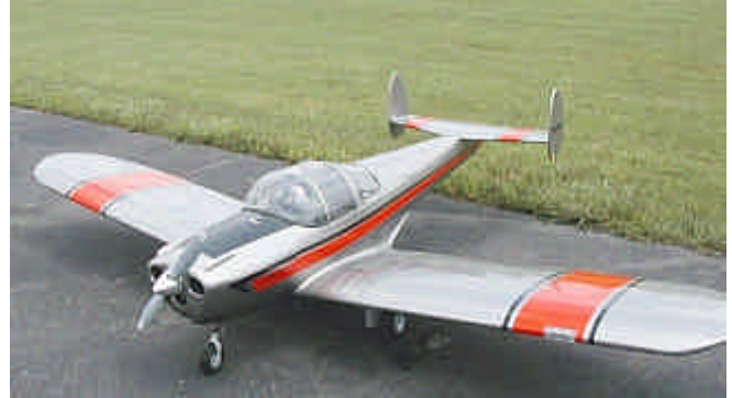
The McEvoy's just had to come home with a kit of this Ercoupe . Only has a 10 foot wing-span!