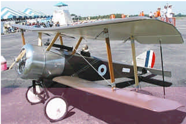
Lots and lots of biplanes.