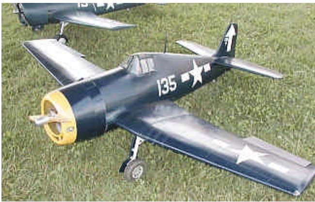
Plenty of war birds!