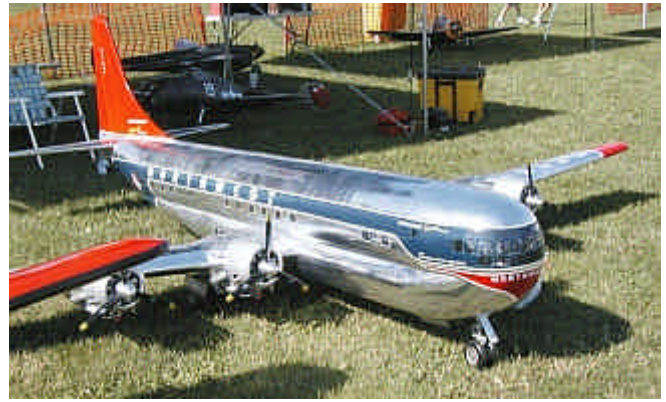
These are some big serious airplanes. Transportation may be as big a challenge as flying.