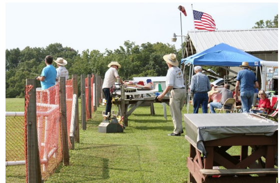
Above is a picture of the crowd enjoying the Fun Fly and the events of the National Model Aviation Day.