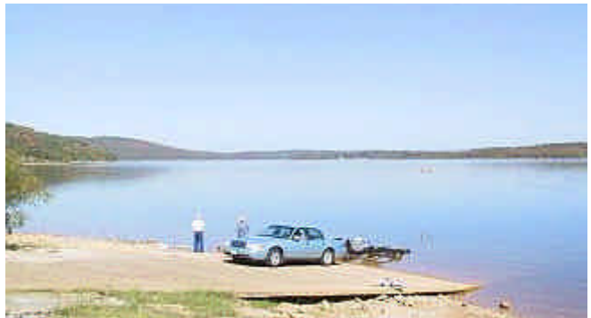
Henry Racette and Roscoe Fudge enjoying some float flying on Table Rock Lake