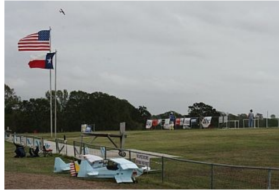
Photos from BEST at Willis, TX