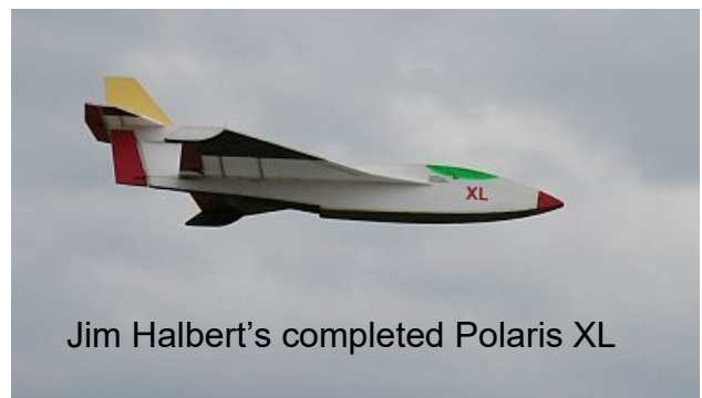
Jim Halbert's completed Polaris XL