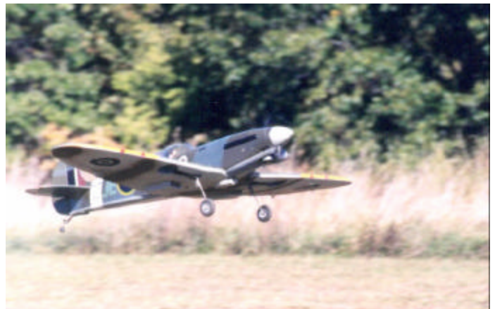
Right. Curt Krause's Spitfire coming in for a nice three point landing.